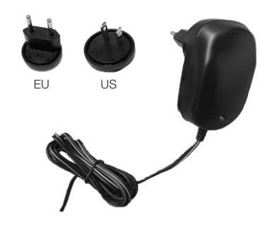
AC Adapter ..... 1 unit Ref. 0028084