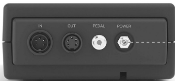
MSE Electric Desoldering Module