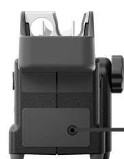
JTS Stand for JTT Heater Hose Set